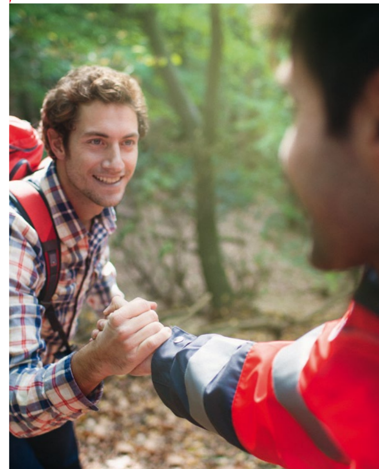
P150240