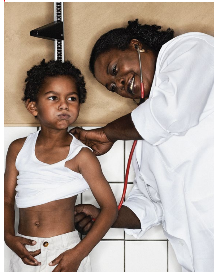
P150240