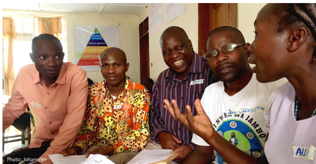
P-FIM training participants discussing open and closed questions, probing questions, goal-free and two-way discussions

The P-FIM exercise in North Kivu differed from Berlin in that the focus was on community engagement as well as on Johanniter and partner staff community engagement capacity . There were 34 participants (of which 13 women) from 17 institutions including local government in the June P-FIM exercise – a remarkable achievement. Equally remarkable was that a Johanniter team successfully carried out two-way community discussion in August, thus demonstrating a high level of application of learning. This was followed by a review of learning with all DRC participants in September, where one after another they shared how they were applying the learning in their personal as well as their professional lives – both inspiring.