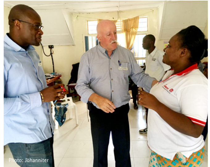
Team of Johanniter staff and P-FIM trainer reflecting on task sharing and group dynamics and briefing the translator before the next exercise.

groups showed a depth of understanding of the medical and social issues relating to establishing a blood-bank and how they are willing to play their part. Thus they provided a significant starting point for Johanniter and the Ministry of Health, as they plan together with communities on how to establish the blood-bank.