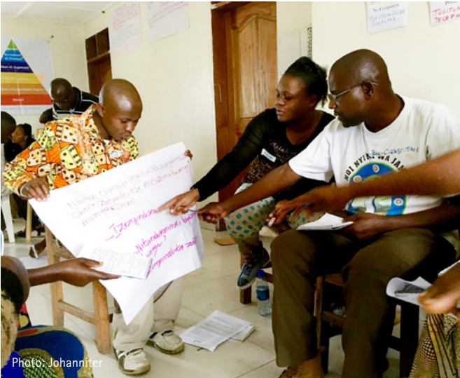
Photo: Johanniter P-FIM training participants translating into the local languages Kiswahili and Kinyarwanda the questions that they will ask the community groups.