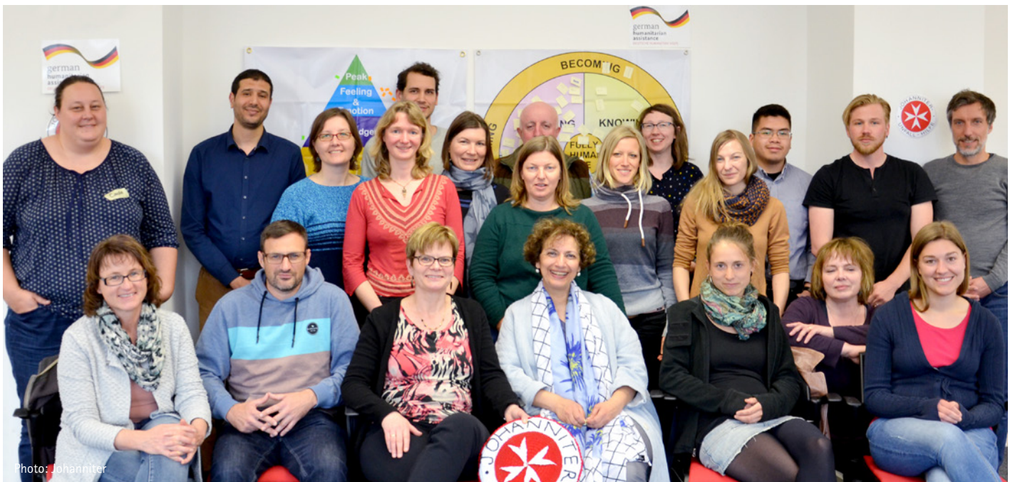
Participants of Berlin P-FIM training.

Johanniter has also encouraged VENRO to plan for three P-FIM TOTs in 2016/ 2017. We recommend to Johanniter and other actors engaged in the current refugee response in Germany and Europe, both governmental and non-governmental, to include P-FIM in the portfolio of their various refugee integration trainings for professionals and volunteers. We recommend to the CHS-Alliance to consider further P-FIM TOTs for its members and other humanitarian actors in order to make accountability to affected people a reality on the ground. We recommend to the IASC Task Team on AAP & PSEA to conduct P-FIM trainings also at HCT and Cluster level in order to have a shared view on the importance of listening to people and how to do it. We recommend to the Grand Bargain work-stream on Participation Revolution to sensitize donors to the fact that there are simple approaches, such as P-FIM, which help to 'Put People First', that funding for such TOTs and trainings be made available, and that organisations need flexibility to be able respond to the priorities and feedback of affected populations and strengthen local response capacities.