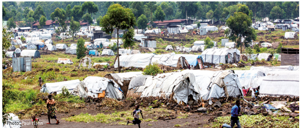
IDP-Camp in North Kivu, DRC