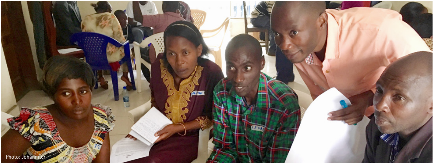
P-FIM training participants in DRC during group work.